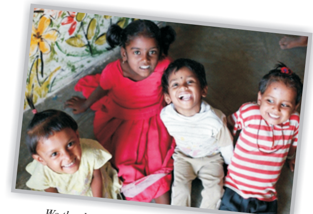
We thank you for supporting our future!